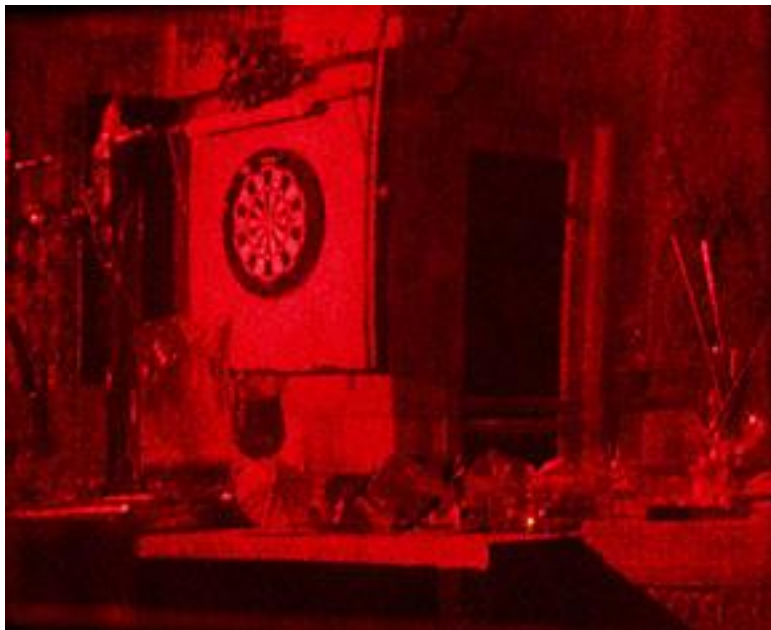
Figure 4 "To Absent Friends", 1989, Laser transmission hologram Silver halide on film, Retrieved from: http://www.jrholocollection.com/collection/dawson.html