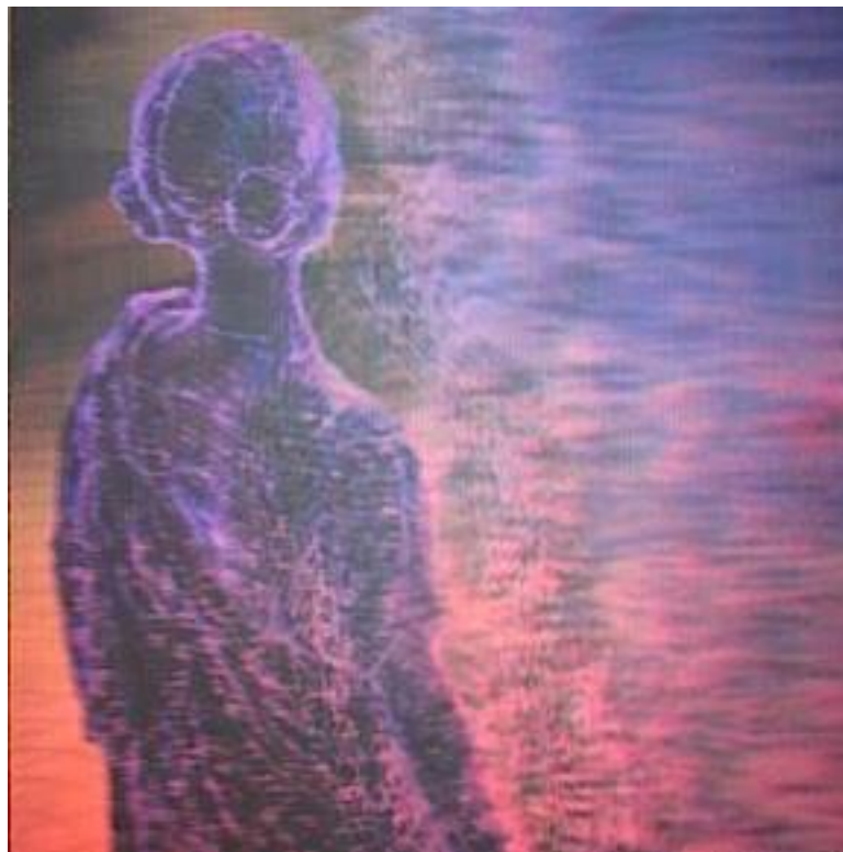
Figure 8 "Luminous Presence", 2007, Computer graphic holographic stereogram, Retrieved from: http://www.jrholocollection.com/collection/dawson.html