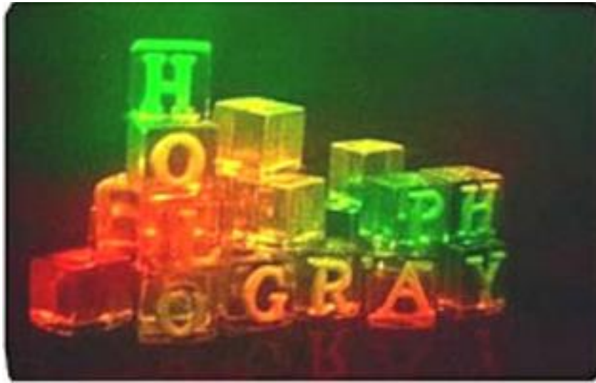
Figure 5 Polaroid Patent Rainbow Hologram, 1975 | Rainbow hologram on film in card mount