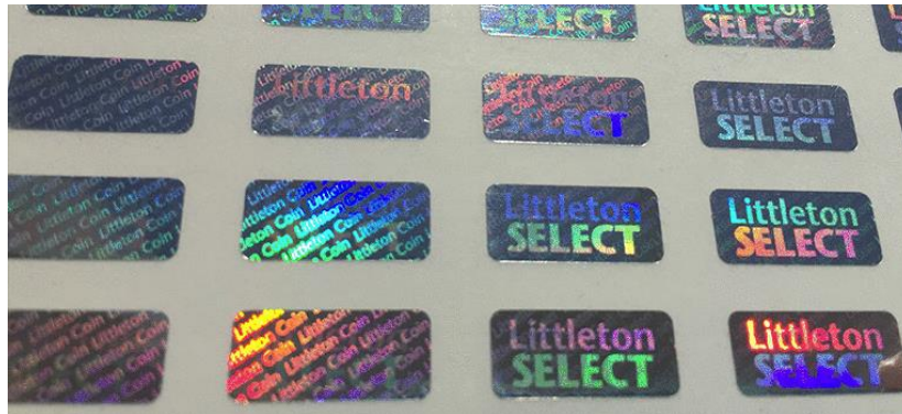
Figure 7 Rainbow transmission hologram with a mirror (aluminized layer) laminated on the back, Retrieved from: https://www.intertronix.com/Custom-Embossed-Holograms-s/1938.htm