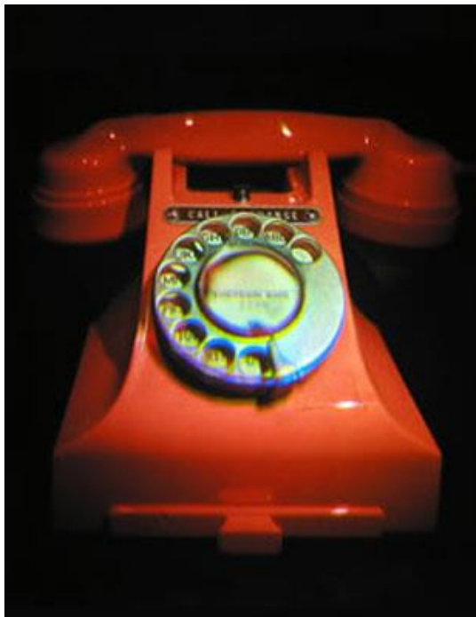
Figure 2 Iñaki Beguiristain, Telephone – Theydon Bois 2286, 2001 Pseudo-colour reflection hologram